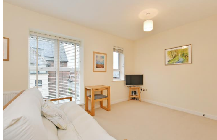
Apart 4 No.82